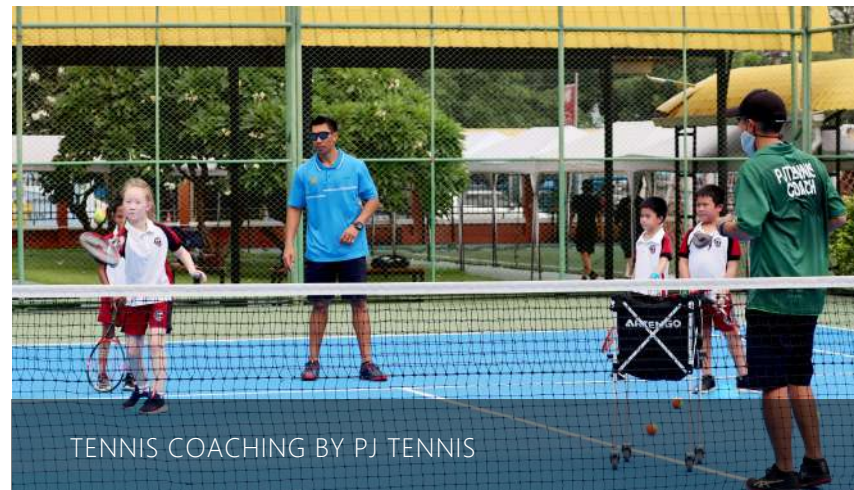
TENNIS COACHING BY PJ TENNIS

students to try new and varied activities throughout their academic year. The wide range of clubs offers something new for each student to try and enjoy. From football to philosophy, drawing to debating, science club to singing there is something for everyone.