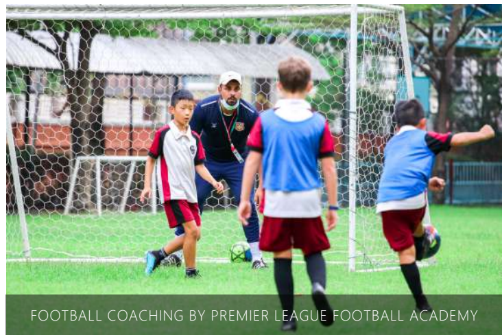
FOOTBALL COACHING BY PREMIER LEAGUE FOOTBALL ACADEMY