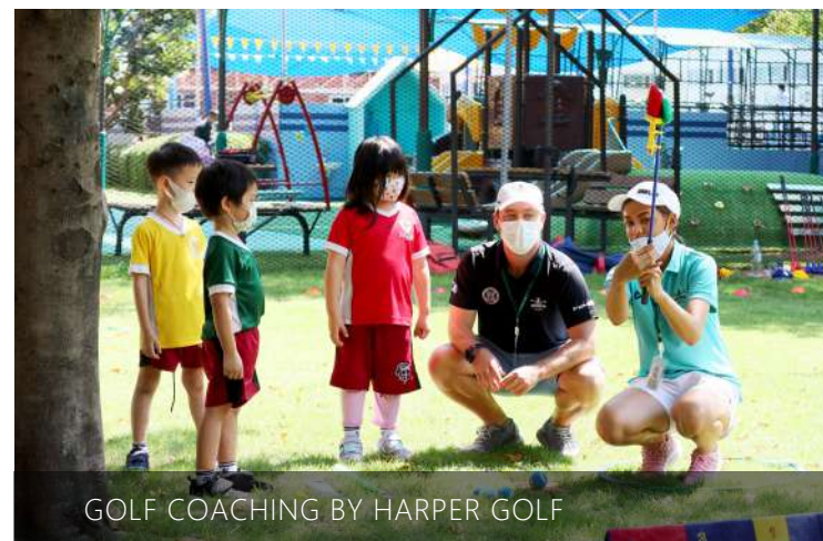
GOLF COACHING BY HARPER GOLF