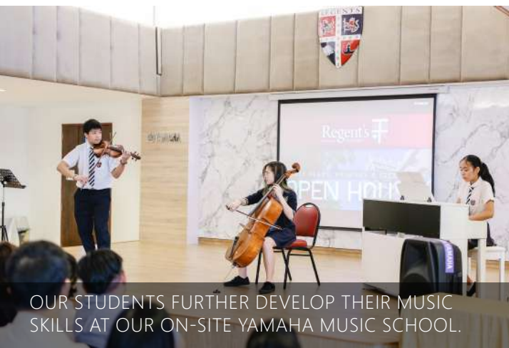
OUR STUDENTS FURTHER DEVELOP THEIR MUSIC SKILLS AT OUR ON-SITE YAMAHA MUSIC SCHOOL.

To guide students into becoming well-rounded, informed, responsible, principled and confident global citizens. To develop understanding of democratic governance; environmental stewardship; adventure, self-discovery and courage; leadership, compassion and service to others.